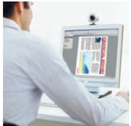
Enjoy Capture Perfect ease