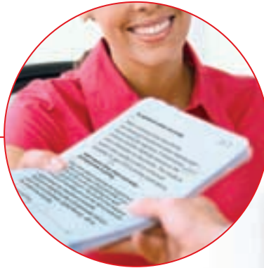
Scan light text and even pencil marks perfectly

An extensive range of image processing functions enhance ease and efficiency. When you're scanning from documents that have been kept in a binder, it usually leaves unsightly marks. The DR-1210C has a 'remove punch holes' function which automatically blanks out these black dots, so you always get clean and clear scans. Other practical functions include auto page size detection, skew correction, border erasure, text orientation recognition, edge emphasis and pre-set gamma curve.