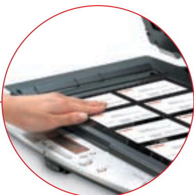
Scan up to 8 business cards in a single run